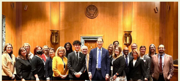
Community college representatives meet with Oregon Senator Ron Wyden.

Click here to review the federal legislative priorities for community colleges.