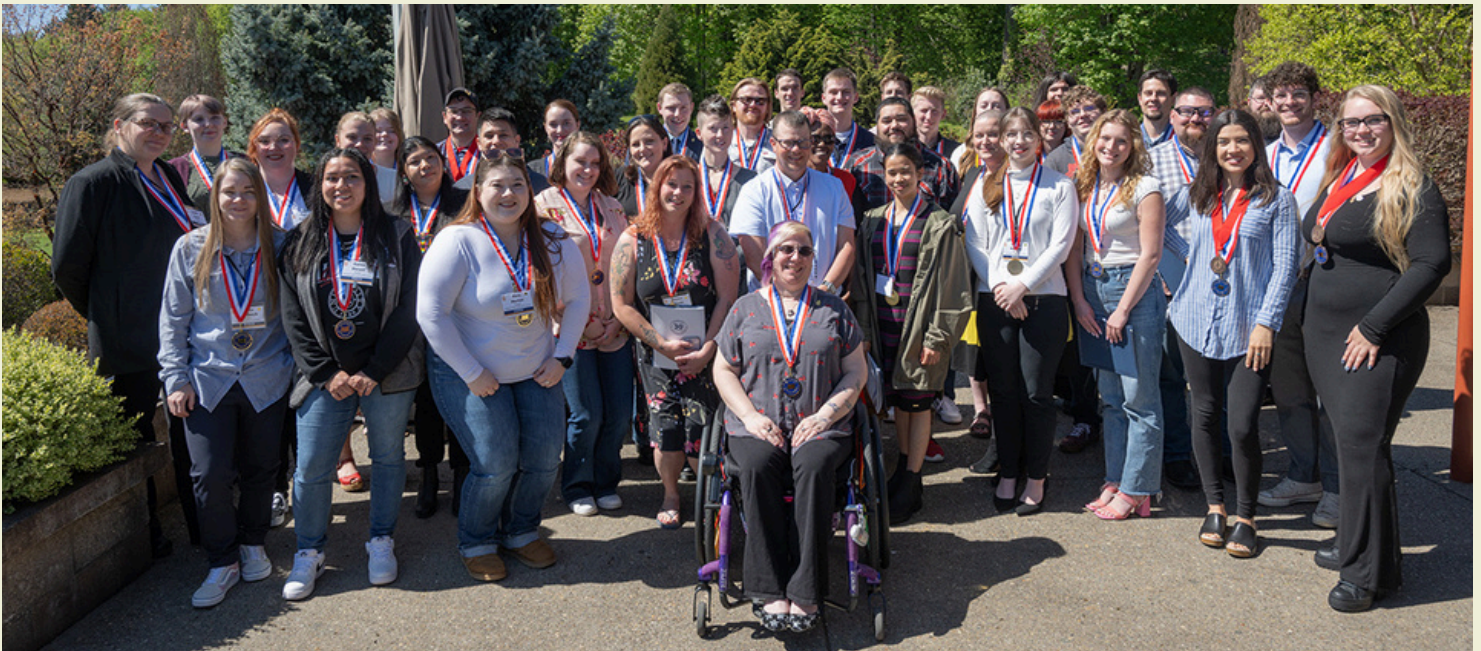
2024 All-Oregon Academic Team