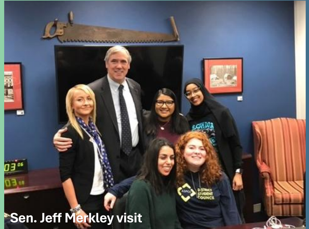
Sen. Jeff Merkley visit