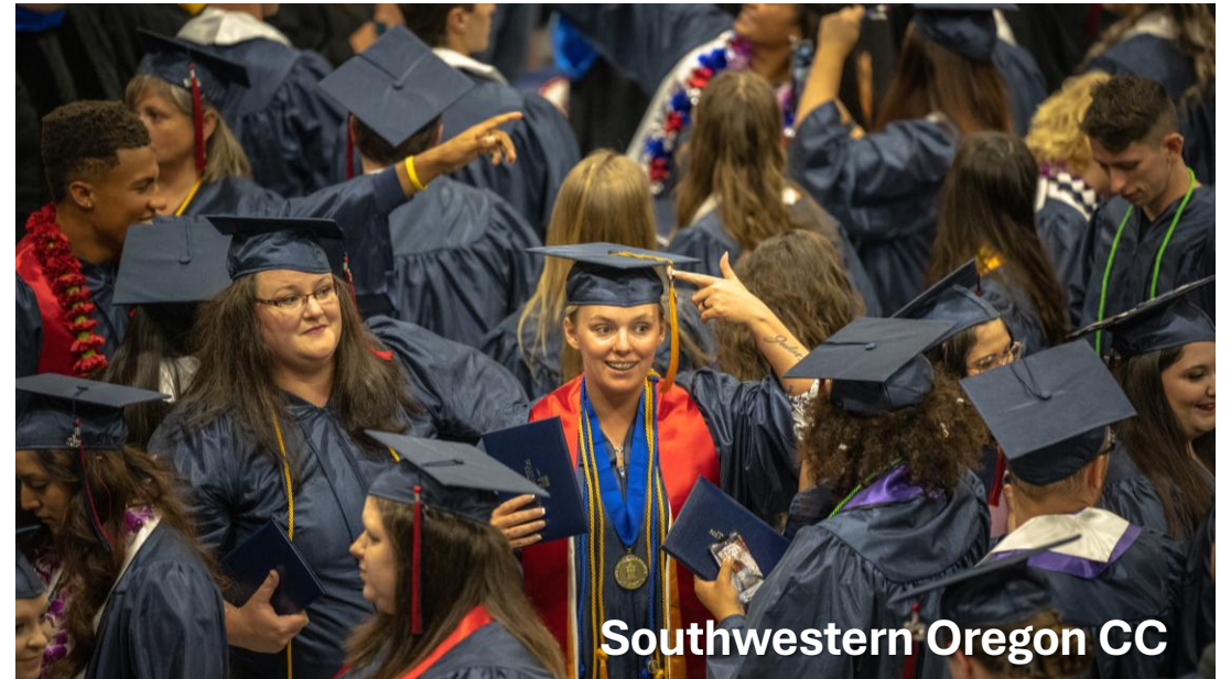
Southwestern Oregon CC