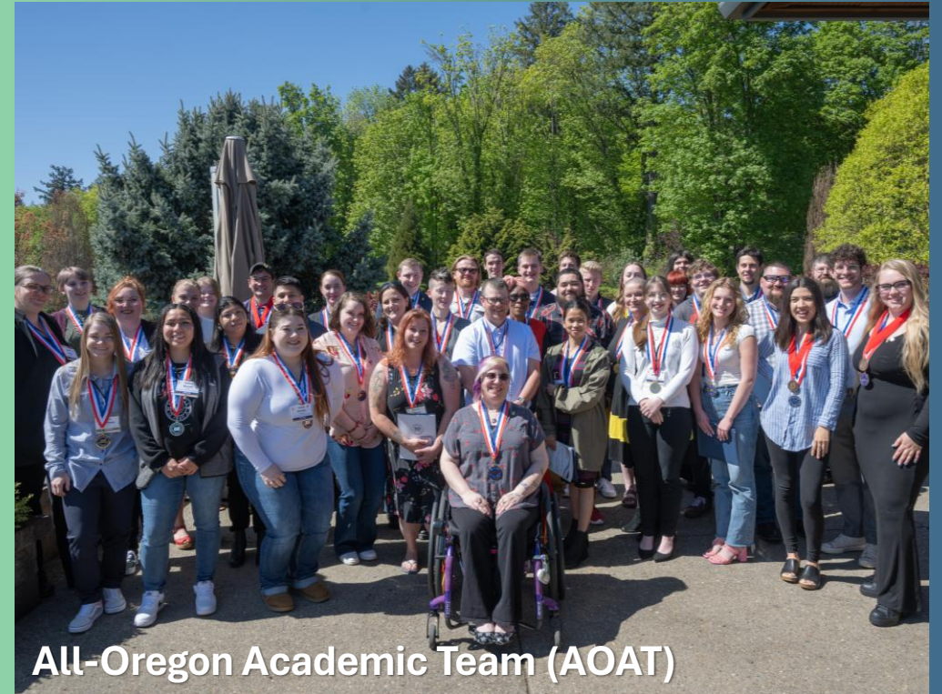
All-Oregon Academic Team (AOAT)