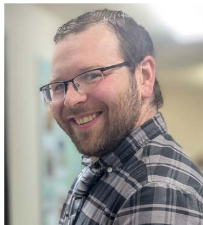
Coca-Cola New Century Workforce Scholar