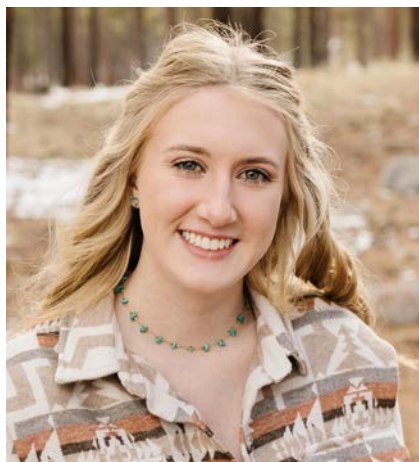
Coca-Cola New Century Transfer Pathways Scholar

Coca-Cola New Century Scholar is a designation bestowed upon students in each state with the highest All-USA Academic Team application score. The program recognizes 100 scholars annually with $2,250 scholarships for the Transfer Pathways Scholars and $1,500 scholarships for the New Century Workforce Scholars.