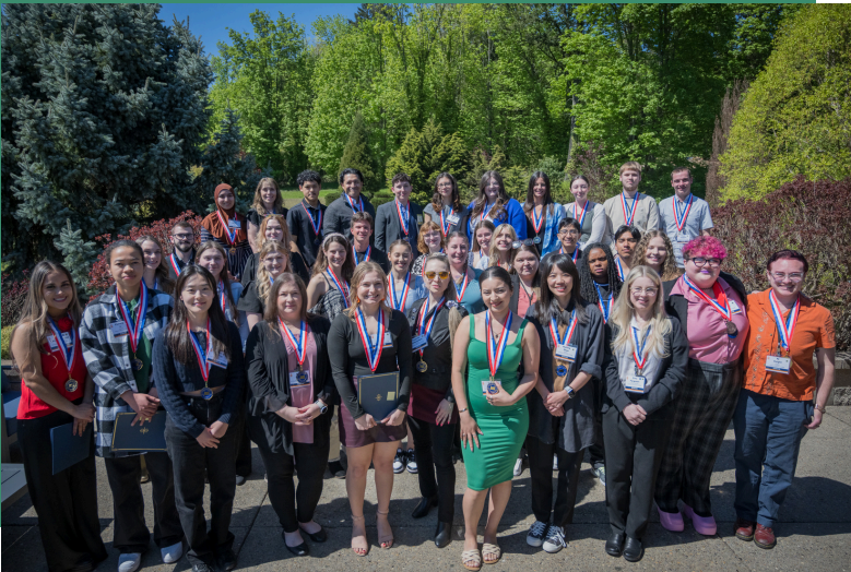
Members of the 2025 All-Oregon Academic Team (AOAT) following the April 18 Luncheon in Salem.