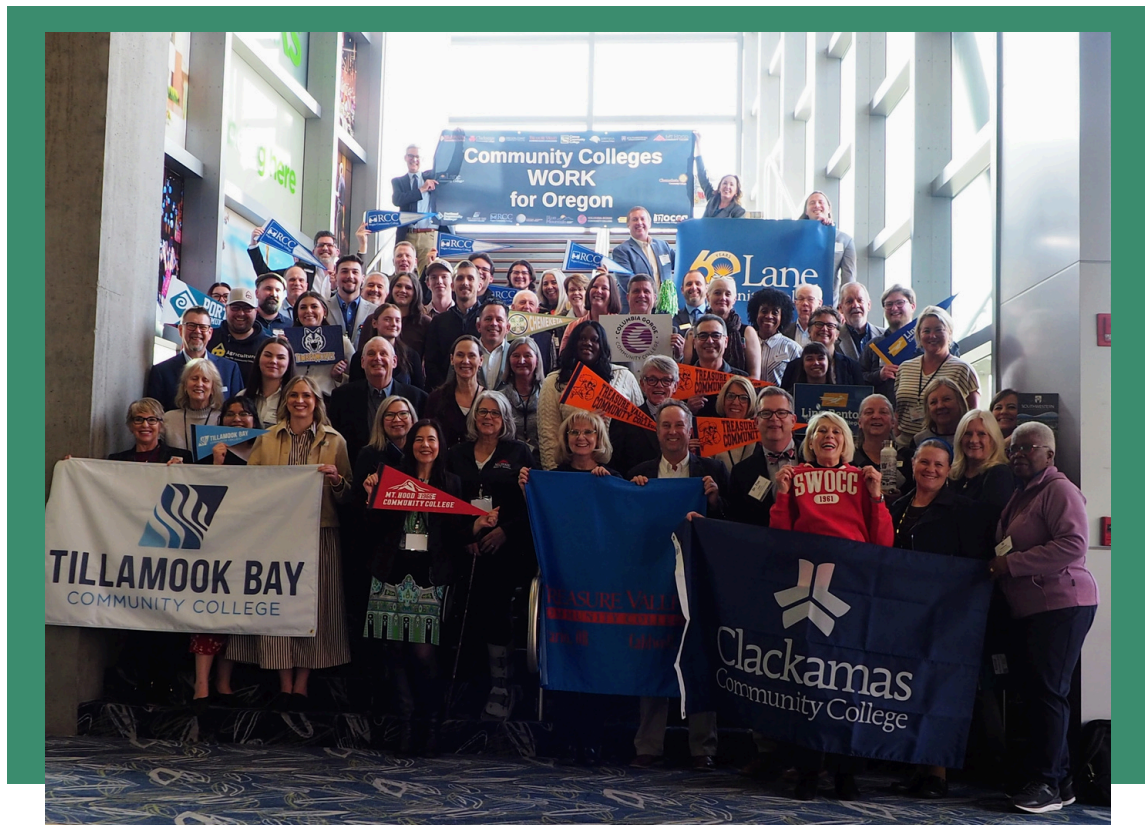
College board members, presidents and OCCA celebrate how “Community Colleges WORK for Oregon” at the 2025 OCCA Legislative Summit.

We look forward to continuing the series in 2025–26 and encourage members to revisit or share past sessions.