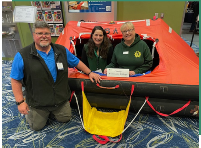
Members of Clatsop Community College's maritime science program show off a raft at the CTE Showcase

On March 5, attendees gathered at the Salem Convention Center for sessions featuring legislators, policy experts, and student leaders. Topics included legislative priorities, advocacy strategies, and the impact of state policy on Oregon's community colleges. The day concluded with a reception and Career & Technical Education (CTE) showcase, featuring wine from Chemeketa and Umpqua's viticulture programs and hors d'oeuvres prepared by Southwestern Oregon's culinary students. All 17 colleges had programs represented at the event, with demonstrations and equipment