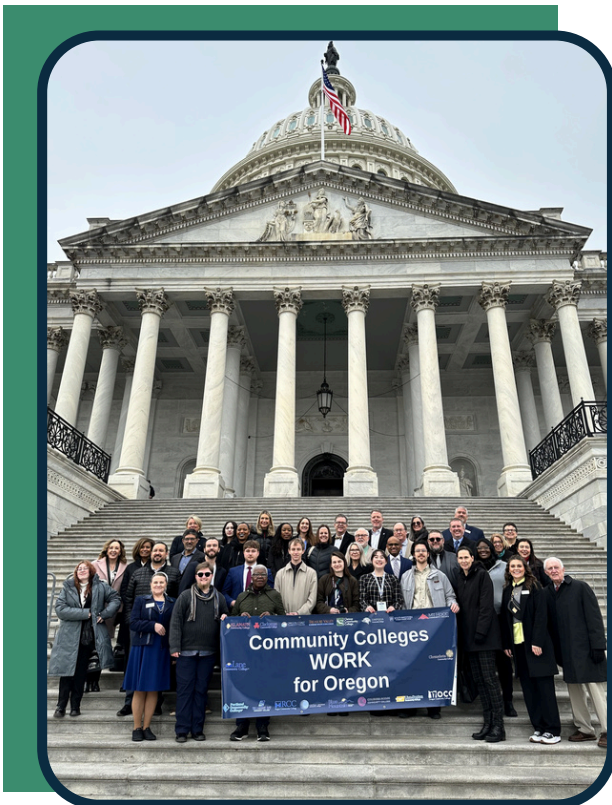
Oregon community college representatives attend the National Legislative Summit in Washington, D.C., in February 2025.

To strengthen messaging , OCCA introduced a new leave-behind brochure linking federal policy to local impact — reinforcing its commitment to shaping national conversations and championing Oregon's community colleges at all levels.