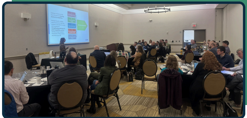
Leaders from 13 Oregon community colleges convened in Portland in May to discuss Guided Pathways implementations.